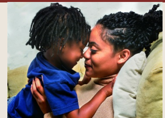
Lots to Celebrate in May! Mothers' Day, Armed Forces Day, Graduations, Memorial Day. Enjoy time with your family and friends and the unofficial kick off to summer!

A holiday since 1984, the Friday before Mothers' Day is Military Spouse Appreciation Day. While this may get overshadowed by Mothers' Day, consider doing a little something special for those military spouses alone on this day – a call, a card, an invite to happy hour in the driveway while the kids ride bikes. Encourage kids whose military parent is away to do something – make a card, make a book to read to the parent at home, plant a flower in a decorated pot, make anything with a kid's handprint on it.