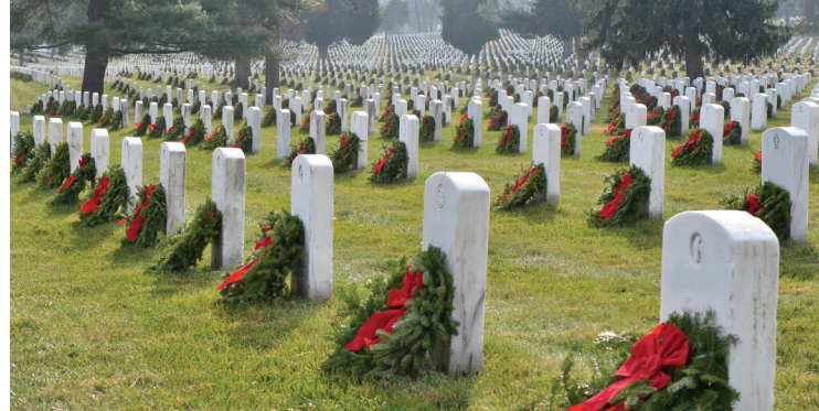
WREATHS ACROSS AMERICA DAY - DECEMBER 17TH