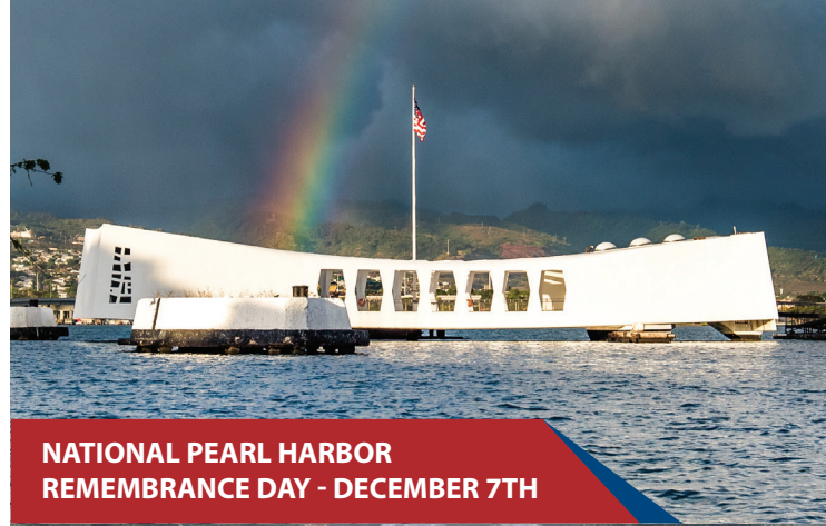
NATIONAL PEARL HARBOR REMEMBRANCE DAY - DECEMBER 7TH

Thank you to everyone who continues to fill out the Satisfacts surveys. We do receive and read EVERY survey and comment that is turned in. We love to hear your feedback about our maintenance techs and we do recognize them weekly internally and pass on your kind words. We would like to shout-out to our entire maintenance team, who each received at least 1 5-star Satisfacts response within the last month.