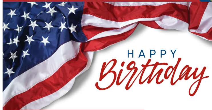
385TH BIRTHDAY OF THE U.S. NATIONAL GUARD - DECEMBER 13TH